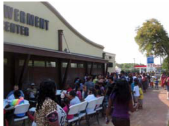
Neighbors waited in line for new school supplies