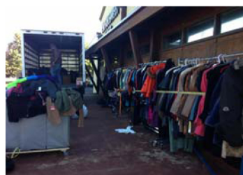
Coat Drive in Progress